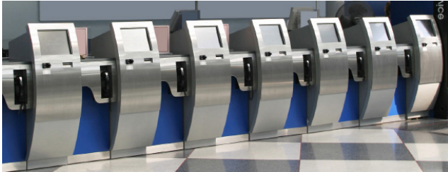
The benefits and characteristics of zTouch™ makes it ideal for high durability applications.

Standalone touch-screen based products such as ATM, Kiosk, Factory Automation and Gaming / Casino units must perform unattended and often under extreme conditions. High tolerance for sunlight, dust, liquids, rough handling, and extreme temperatures requires characteristics traditionally not provided by today's touch-screen technologies. To address the robust needs of this market, F-Origin developed a touch technology based on force, called zTouch™.