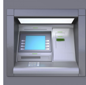
zTouch™ is ideal for integration into ATM units.

Since the touch sensors are placed behind the touch surface, there is no performance degradation or occurrence of "dead zones" due to surface contamination, reducing the need and overhead for cleaning the touch-screen surface.